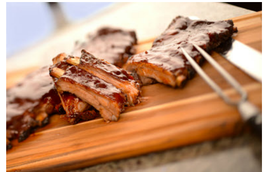
Sal is serving RIBS!!!!

Loyal Order of the Moose P.O. Box 6099 Eureka, CA 95502 Lodge Phone (707) 443-1073