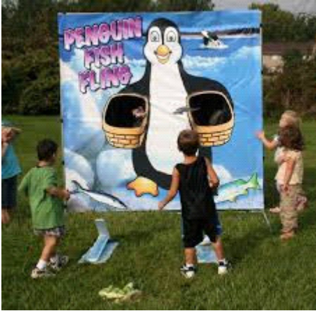
FUN GAMES & PRIZES